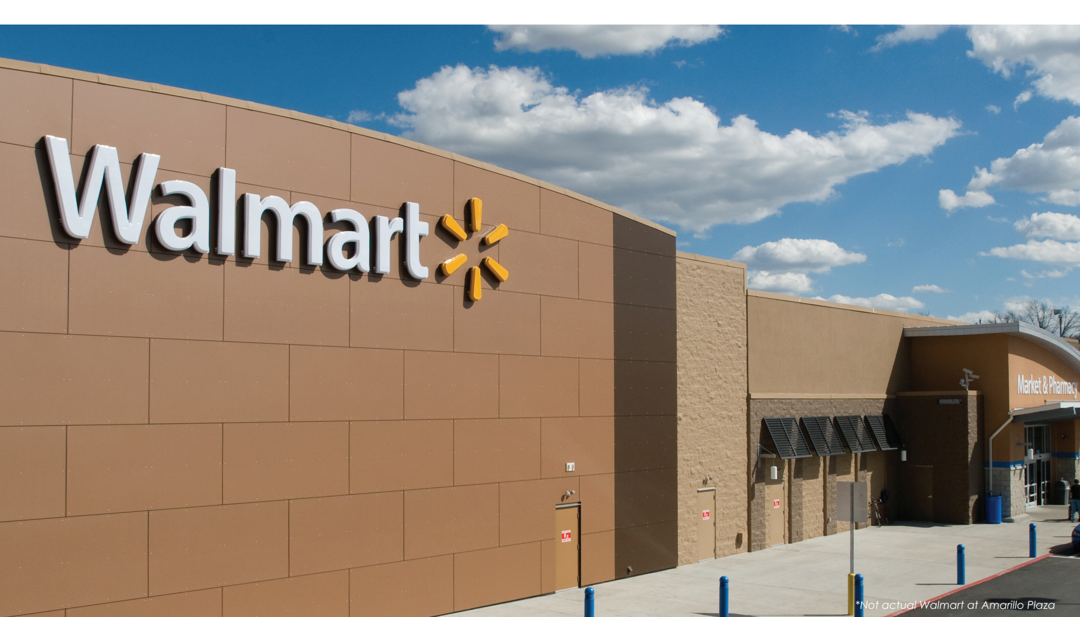
*Not actual Walmart at Amarillo Plaza